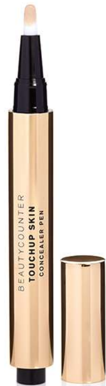
TOUCHUP SKIN CONCEALER PEN $28.00